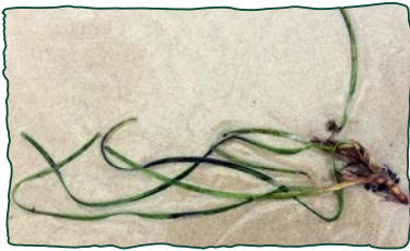
(Beachcast): © W. Moyse CC BY-NC 4.0