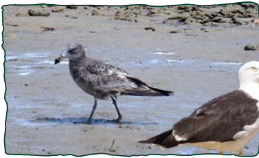
(Juvenile) (Adult)

These distinctive shorebirds are often found along coasts using their strong, red beak to stab and pick at prey such as molluscs, crabs and worms. Sooty oystercatchers (black) prefer rocky shores, and pied oystercatchers (black & white) are usually seen on sandy shores. Sometimes an oystercatcher will take a shell to a flat rock where it can use its beak to hammer at the shell until it breaks open.