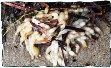
© J. Baker, CC BY Attribution