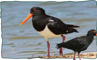
(Pied) (Sooty)