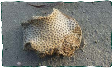
© C. Meurk, CC BY-SA 4.0

Sponges are simple animals that have a skeleton made up of a fibrous material called spongin, usually strengthened with glass-like spicules. Sponges pump water through pores in their structure to extract food, and expel the waste water through larger holes called osculae. Sponges of many different shapes and sizes are washed up on beaches after storms.