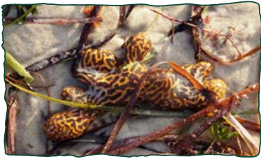
© M. Bossley, CC BY Attribution

Sea tulips are solitary ascidians or 'sea squirts' and have a tough jelly-like body with two openings, one drawing water and food particles, the other expels waste. Their bodies can grow up to 10cm long with a stalk up to 30cm long.