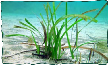
(Living plant): © D. Muirhead CC BY-NC 4.0