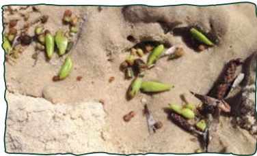
(Fruits)